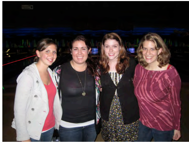
Molloy College Shenandoah University