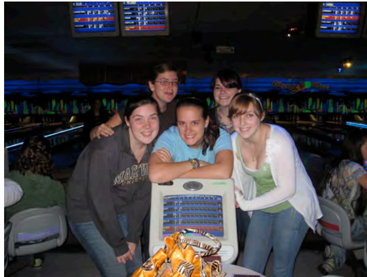
Marywood University Elizabethtown College