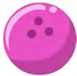
Immaculata University Temple University