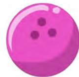
Nazareth College SUNY Fredonia