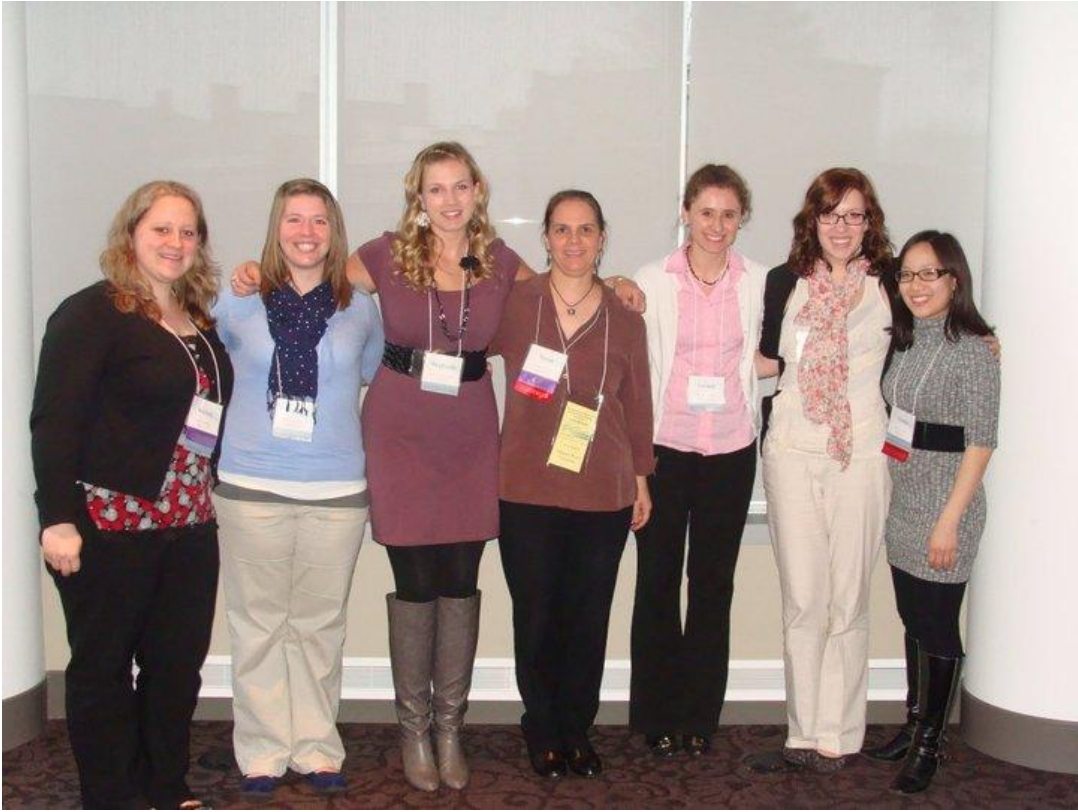
2010-2011 Executive Board