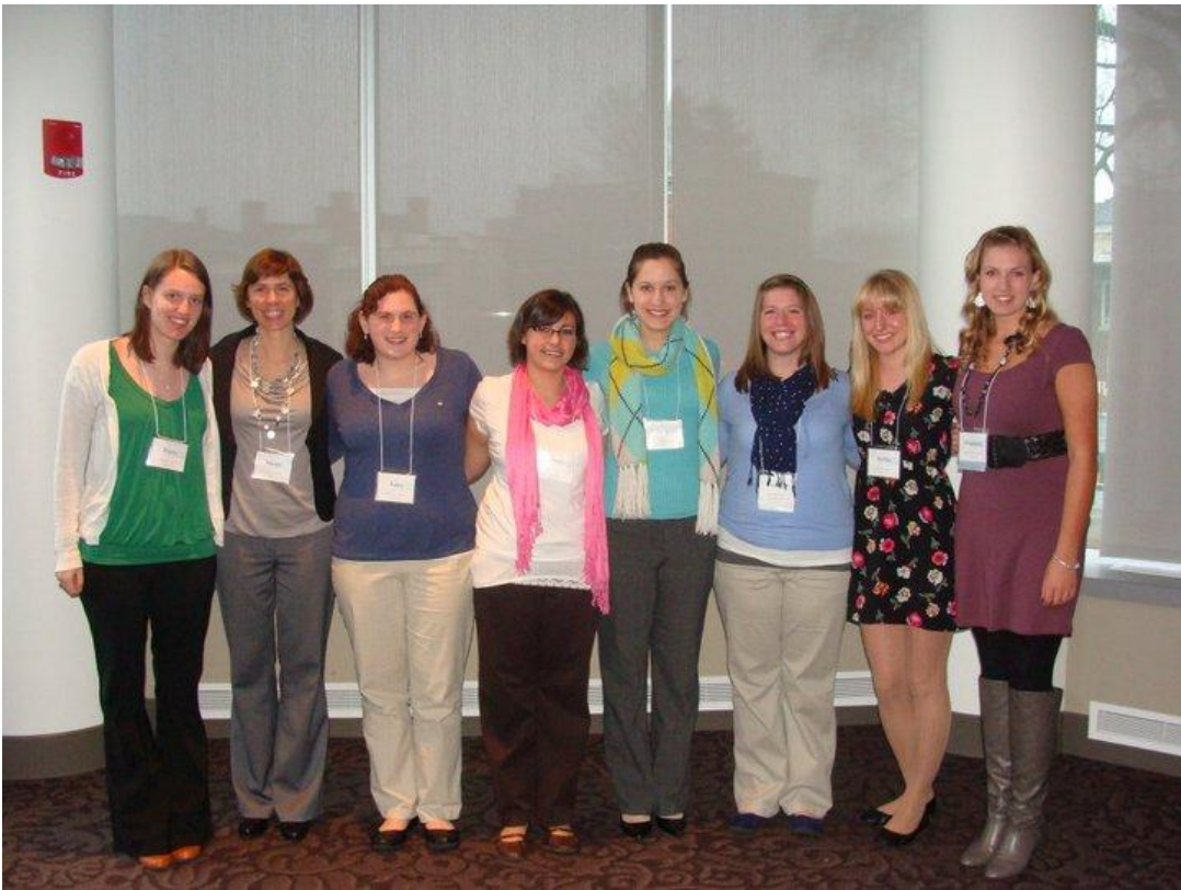
2011-2012 Executive Board